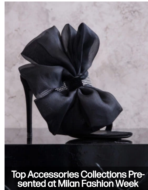
Top Accessories Collections Presented at Milan Fashion Week