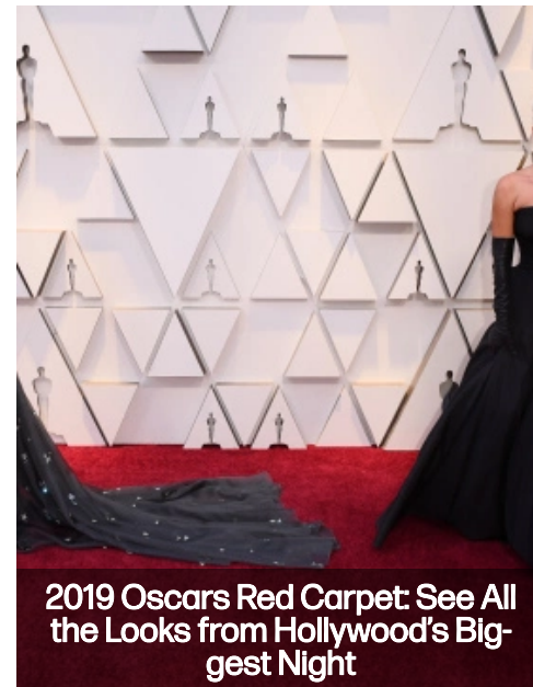
2019 Oscars Red Carpet: See All the Looks from Hollywood's Biggest Night